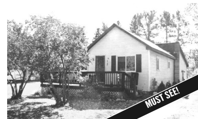
405 UNION STREET, EAST JORDAN What an amazing backyard, a fire pit with hand carved logs to sit on for entertaining, great landscaping and a deck too. MLS 438606. Ask for Holly Nierman. $74,900