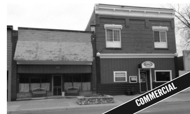
113-115 MAIN STREET, EAST JORDAN This bar/restaurant is a turnkey operation. 2 buildings have been combined, both w/ many updates and great sales numbers. MLS 439379. Ask for Mike Stark. $329,000