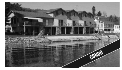
2540 S M-66 HIGHWAY, EAST JORDAN 2199sq ft condo with 22ft waterfront on the SOUTH ARM of LAKE CHARLEVOIX. 3 BR, 3 1/2 BA, new deep water boat slip. MLS 440455. Ask for Mike Stark. $299,900

109 Mill Street • East Jordan • 231-536-7700