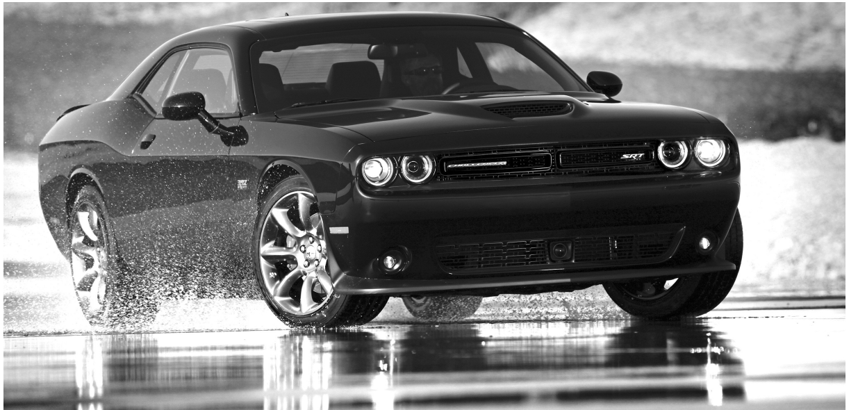
The newly consolidated Dodge and SRT brands are launching out of the gate at full throttle, introducing the new 600-plus horsepower 2015 Dodge Challenger SRT with a Hellcat engine.