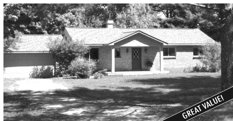
3680 N US 31, KEWADIN • $94,900 Beautifully updated ranch with 44 feet of shared frontage on Torch Lake. Great year around home or Up North get away. New roof, new kitchen cabinets, countertop, appliances and flooring. Curl up by the fireplace or take a dip in beautiful Torch Lake. MLS 440881. Ask for Mike Stark.