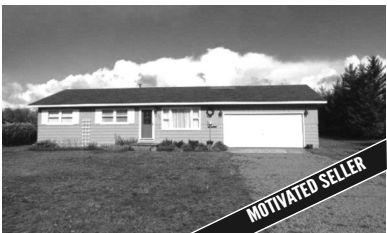
923 S INTERMEDIATE LK • CENTRAL LAKE Squeaky clean home with a spacious backyard! 2-car garage. A short walk to all-sports Intermediate Lake public access!!! MLS 438787. Ask for Mike Stark. $79,900