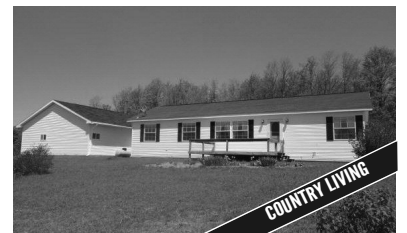
2403 W M-32, EAST JORDAN This 3 bed 2 bath home sits in a beautiful countryside setting including 8 acres. Garage is attached and heated. MLS 440704. Ask for Jennifer Burr. $149,000