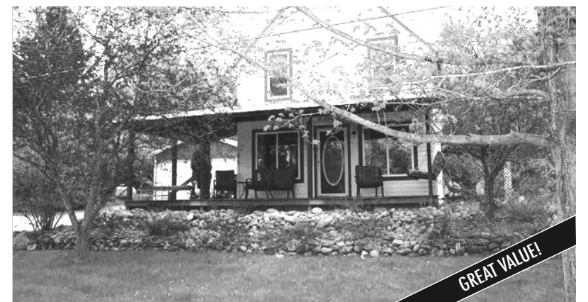
05382 MILES ROAD, EAST JORDAN • $169,900 This would make a great up north retreat or year round home for your family. This four bedroom 1 1/2 bath home has real hard wood floor throughout. Wait till you see this kitchen it is one of a kind handcrafted. Great open floor plan for entertaining, close to lakes and snowmobile trails. There is a 2 car garage with a barn attached and a lean to for extra storage, there is also another stand alone bonus garage, enough room for all your toys. MLS 440671. Ask for Holly Nierman.