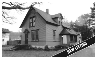
704 PROSPECT STREET, EAST JORDAN Older home in a nice area of town. Home could use some updates, but has lots of charm as is! Great Price! MLS 440483. Ask for Jennifer Burr. $49,900