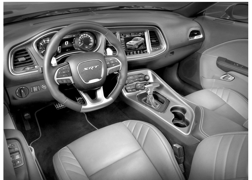
Inside the 2015 Dodge Challenger is an all-new enthusiast-centric cockpit with world-class materials, execution and technology.

At the front, new fascia designs and all-new vertical-split grille provide a menacing update of its 1971 inspiration. A larger, power-bulge aluminum hood features a dedicated “cold-