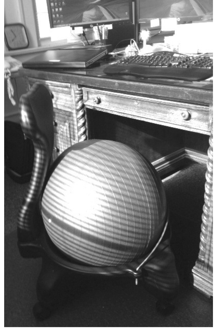
Using an exercise ball rather than a desk chair is one way to begin to counteract the negative impact of a sedentary lifestyle.

versity of South Carolina found similar results. In a study of adult men, those who spent more time sitting were more likely to die of heart disease. Men who were sedentary for more than 23 hours per week had a 64 percent greater risk of dying from heart disease than those who were sedentary for less than 11 hours per week.