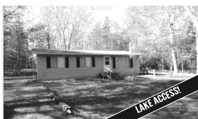
03653 COMMODORE DRIVE, EAST JORDAN Friendly community with private boat slips, sandy beach and family picnic area. Three BR, 1.5BA w/ Lake Charlevoix access! MLS 436953. Ask for Mike Stark. $84,900