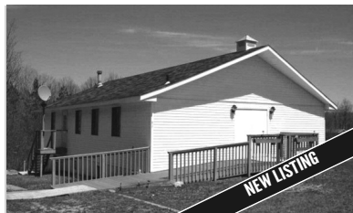
812 ERIE STREET, EAST JORDAN Endless possibilities! 4.88 acres within the city limits of East Jordan. Was once used as a church. Large parking lot. MLS 440333. Ask for Mike Stark. $99,900